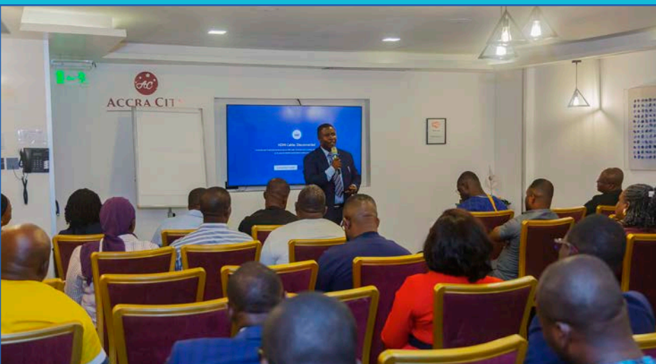
Head of Admissions addressing the forum

Discussions focused on increasing visibility for the university's programs and events, and media partners reaffirmed their commitment to supporting these efforts. The university looks forward to continued collaboration to expand its public outreach and influence.