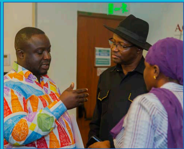
Vice President & Provost interacting with media reps